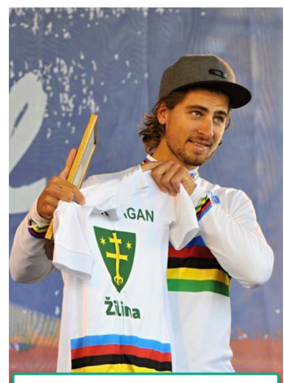
Peter Sagan - World Champion

He was born and raised in Žilina, but currently lives in Monaco due to a number of reasons one of them is the best conditions for training. He often visits Žilina and became a celebrity and one of the drivers for increased sport activity among young people and children. He is a good example of how one person can change the approach towards sport in the whole city.